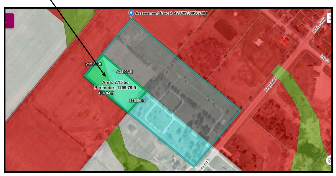
Figure 3. The proposed lands to be added to the Settlement Area Area to be included within the settlement area.