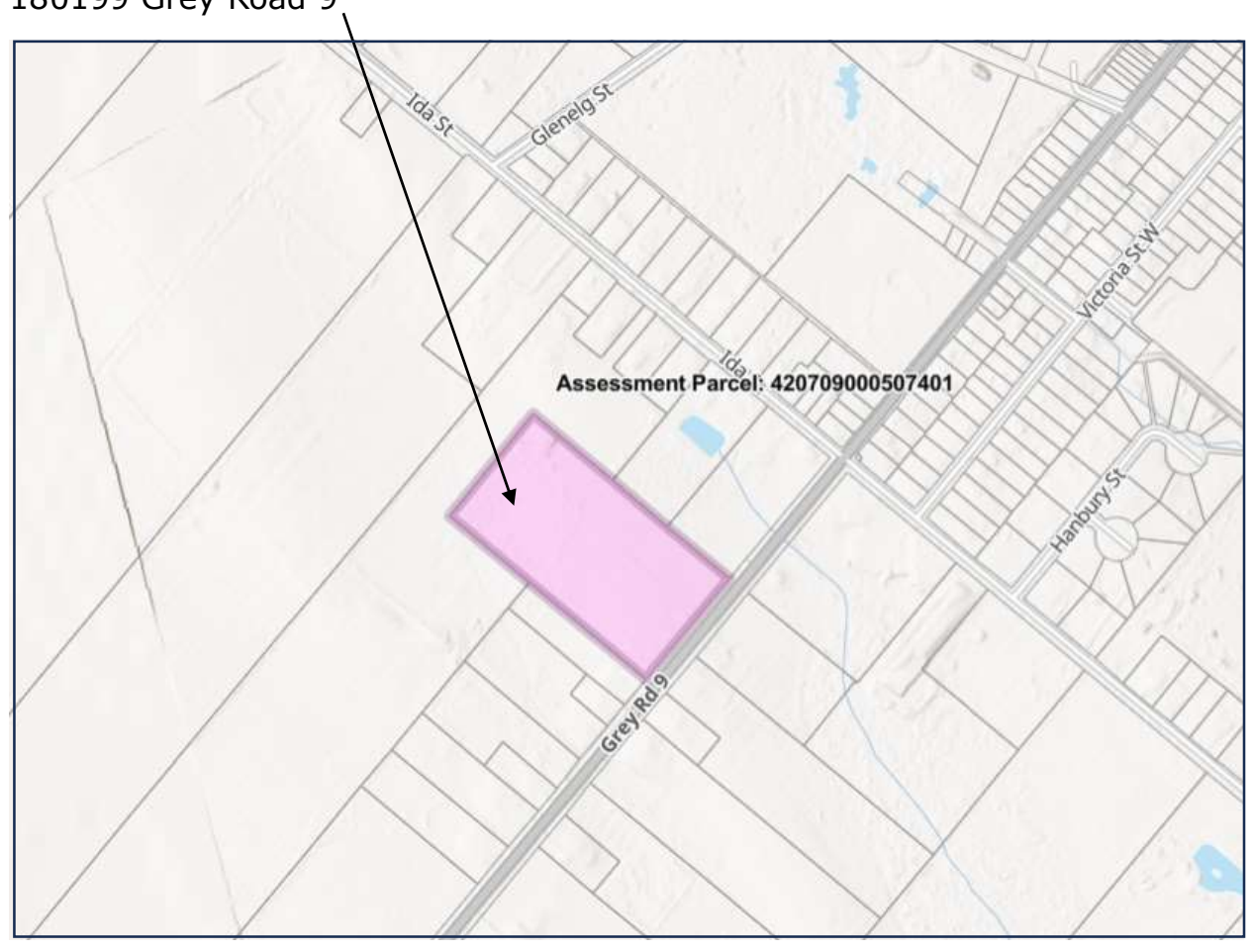
Figure 1 The Subject Lands 180199 Grey Road 9